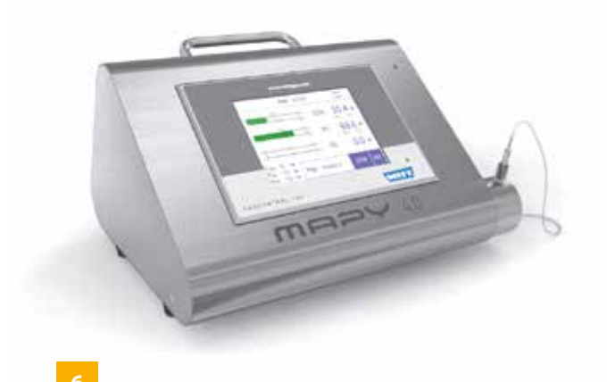
MAPY - O<sub>2</sub>/CO<sub>2</sub>/CO/N<sub>2</sub>O/He/C<sub>2</sub>H<sub>4</sub>